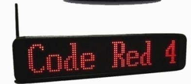
Wireless Sign Boards